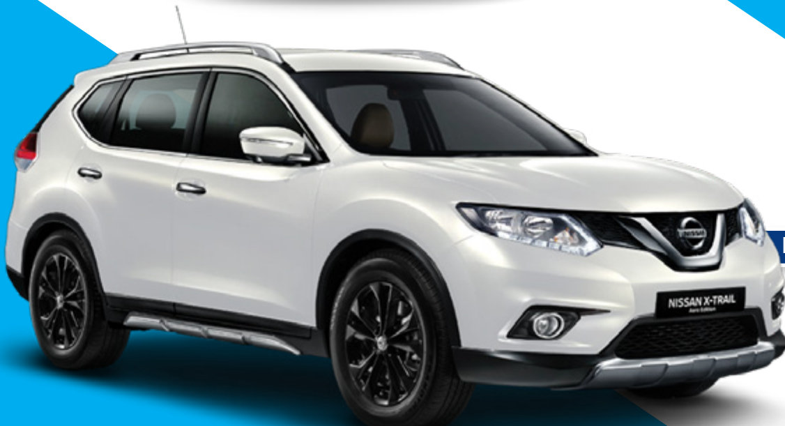
Nissan X Trail