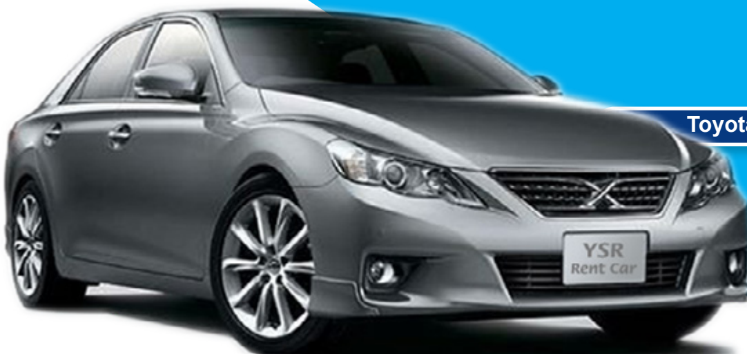
Toyota Mark X